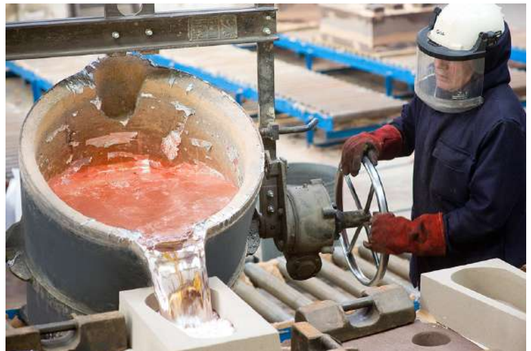
Fig 2 Molten Aluminium Poured from Ladle