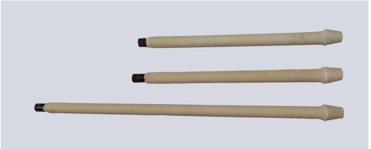
Fig 1 Different Sizes of Thermowell with Aluguard

Aluguard is a special purpose thermowell with refractory surface which resists erosion and fast eating up-off by molten Aluminium. The refractory material along with special intrinsic packing used which provides high thermal resistance. Further no additional coating is required to prolong working life, the tip of Aluguard is constructed with special arrangement which provides good protection from high heat during dipping in molten aluminium to provide better life to sensor and thermowell.